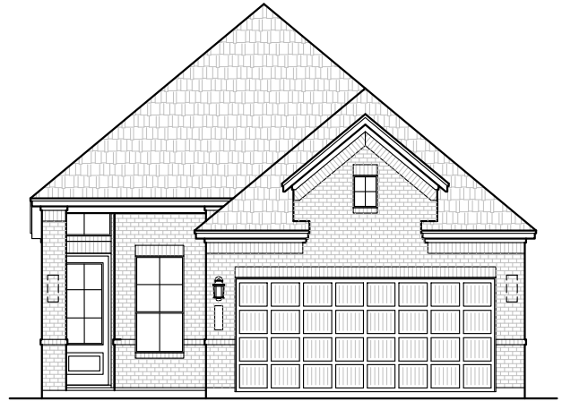
FRONT ELEVATION 'A2'