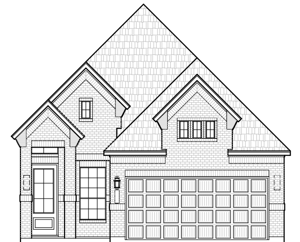
FRONT ELEVATION 'C2'