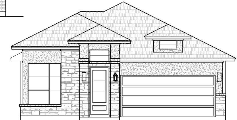
OPT. ELEVATION B w/STONE