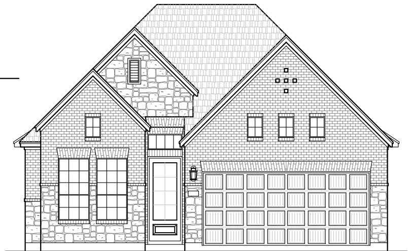
OPT. ELEVATION A w/STONE