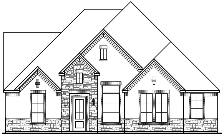
ELEVATION A - STONE