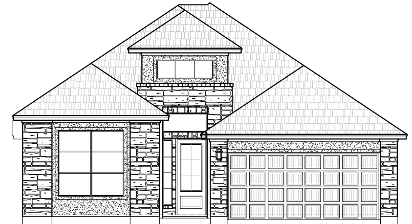
Elevation C STONE OPTION