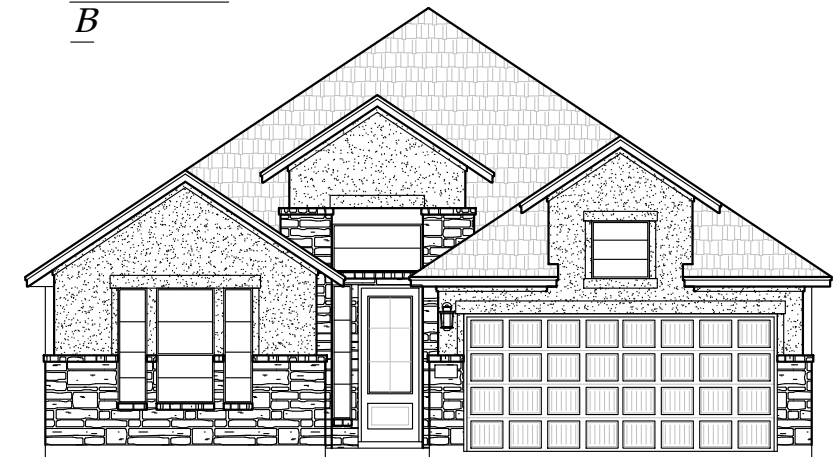
Elevation B STONE OPTION