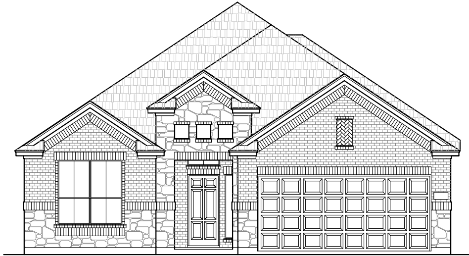
Opt. Elevation A1

Plan 2071 • Lucas • 2,330 Living sq. ft. 2,078 Conditioned sq. ft.