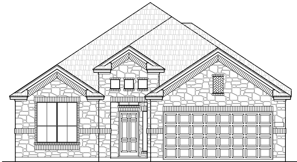
Opt. Elevation A2