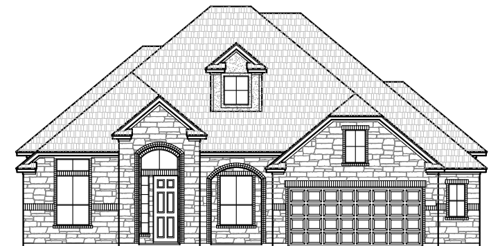
Optional Elevation D2