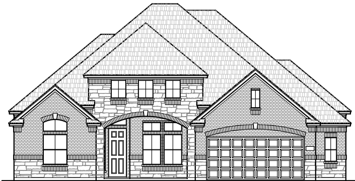
Optional Elevation B1