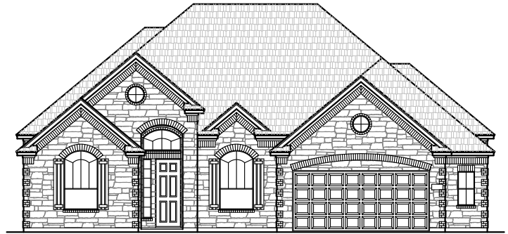
Optional Elevation A2