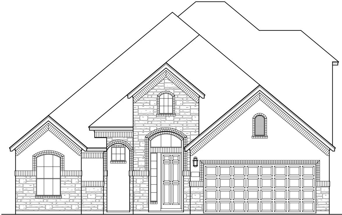
FRONT ELEVATION 'A1' STONE OPTION

Plan 304745 | 3047 Square Footage | 4 Bedrooms | 3.5 Baths | 2-Car Garage